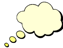
thinking using my brain (mental calculations)