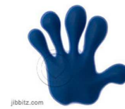
counted using my fingers